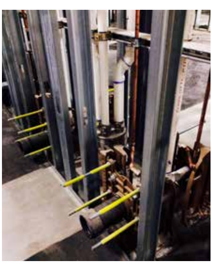
Back to back toilet installation

AcornVac, introduced a revolutionary new way of moving drainage into the overhead ceiling space by utilizing vacuum on a closed piping network.